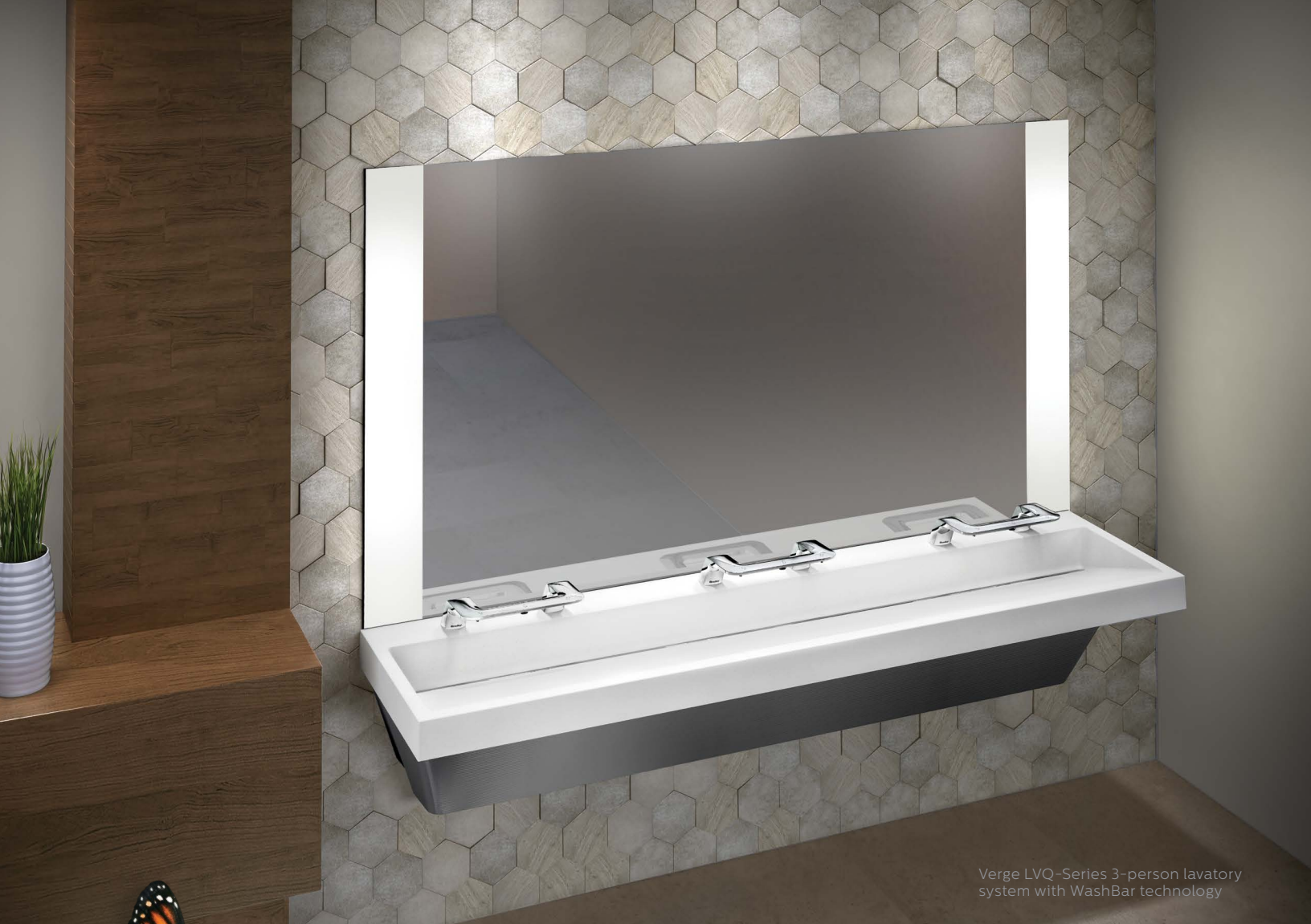
Verge LVQ-Series 3-person lavatory system with WashBar technology